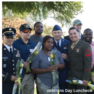
Veterans Day Luncheon