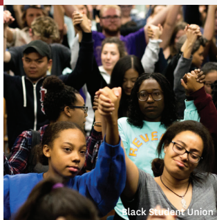
Black Student Union