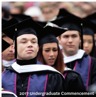
2017 Undergraduate Commencement