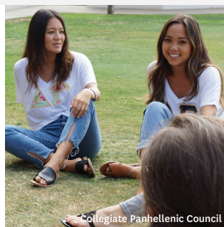
Collegiate Panhellenic Council