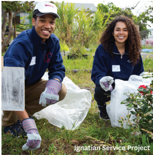
Ignatian Service Project

ASLMU launched the Let Your Vote Roar campaign, which encouraged students to participate in the national presidential election. Campaign activities included voter registration, campus-wide debate watch parties and a R.O.A.R. Rally.