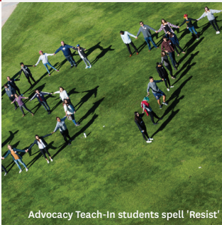
Advocacy Teach-In students spell 'Resist'