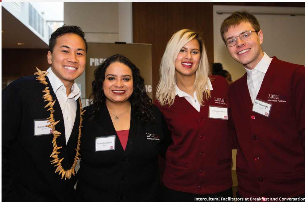
Intercultural Facilitators at Breakfast and Conversation